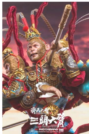
Fig 3. Three heads and six arms of Monkey King produced by In flames Toys