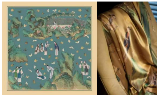
Fig 1. The silk scarf “butterfly of the Dream of Red Mansions” designed by KEYIART team

excellent examples of using traditional method to express Chinese classics in real objects. For example, the scarf. The silk texture perfectly conveys the femininity of female characters in “The Dream of Red Mansions”, and thus properly expresses the “meaning” of the classics.